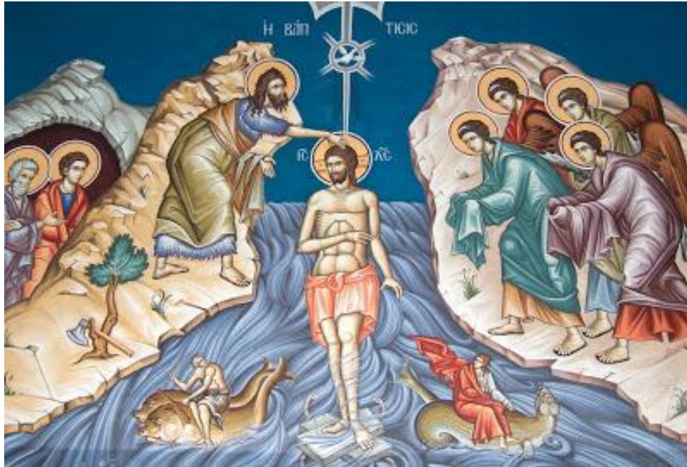
Image from www.johnsanidopoulos.com/2013/01/the-holy-theophany-of-our-lord-jesus.html

Text from THE PROLOGUE of Ohrid (VOLUME ONE: January to June)