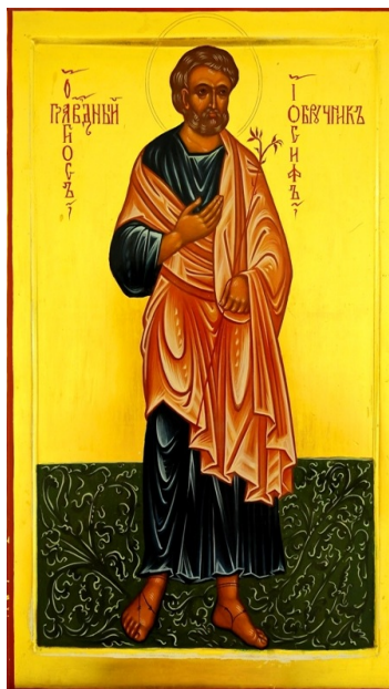
HOLY RIGHTEOUS JOSEPH THE BETROTHED

In Jerusalem, the saints mentioned above were combined with a feast that the Jews of Hebron celebrated on December 25 or 26 in honor of the Old Testament Patriarch Jacob. Later on, the Christians substituted St James (October 23) for Jacob [ 'James' is the Anglicized name for 'Jacob' ] and then the commemoration of the Brother of the Lord became associated with his ancestor King David. In time, St. Joseph was linked with Ss David and James.