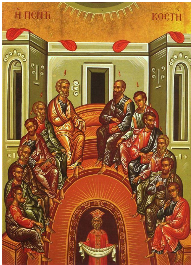
Feast of Pentecost Icon